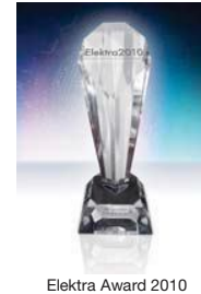
Elektra Award 2010